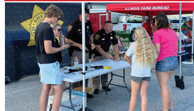
The Henry County Sheriff's Department participated in the Farm Bureau's "Safety Starts with YOU" event held in July. This was the second year that the Health & Safety Committee hosted a community event to promote safety, mental health, and overall wellness.