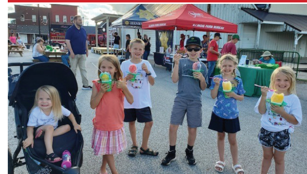
Children attending the Farm Bureau's "Safety Starts with You" event ended their night with a delicious treat from Tropical Sno!