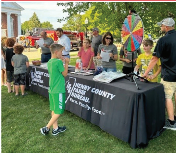
The Farm Bureau Education Committee participated in Geneseo's National Night Out event on August 1. The committee had fun games for both children and adults while sharing information about farming and food.