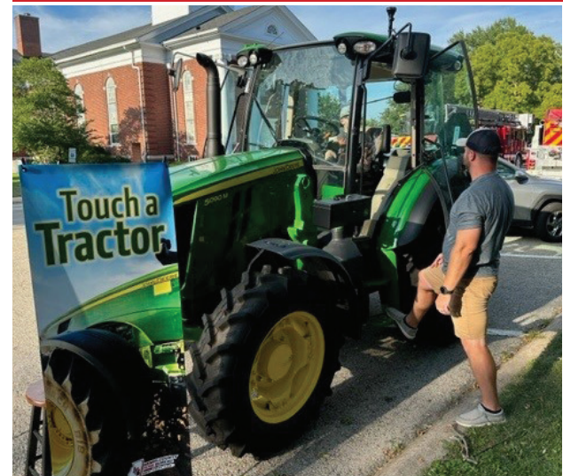
As part of National Night Out, the Education Committee sponsored "Touch a Tractor" for children and adults to climb in the cab of the John Deere. Special thanks to Prairie State Tractor of Geneseo!