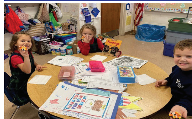
Kindergarten students at Visitation School learned about turkeys and made a turkey cookie.