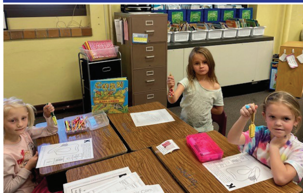
Galva first grade students learned about different kinds of corn and made a corn craft during their Agriculture in the Classroom lesson.